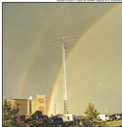
No "Funk 49" here, as it looks like the radio gods were smiling on the N0LP operation.