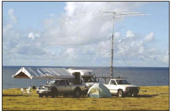
The Maui Amateur Radio Club, KH6RS, probably set a record for the largest average distance per contact, since they claim all of their QSOs were at least 2000 miles in distance! Not a bad place to "Take a Look Around."